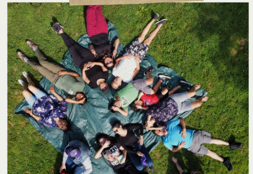
"Sanando en la naturaleza" environmental program -in partnership with COPAL

Metrics include both inreach and outreach community programming for 2025