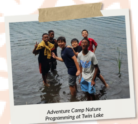
Adventure Camp Nature Programming at Twin Lake