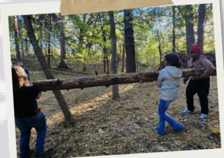
"STEM in Forestry" -with Hall STEM Academy Super Scientists