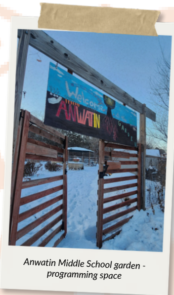
Anwatin Middle School garden - programming space