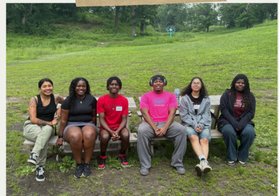
Meet the Summer 2025 team! From L-R (Environmental Education and Justice Specialist, Environmental Internship Interns)