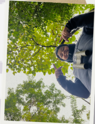
"Tree ID Orienteering" -in partnership with MAIC