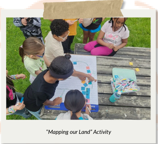
"Mapping our Land" Activity