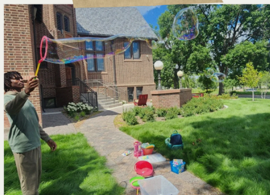
Youth leaders in community programming