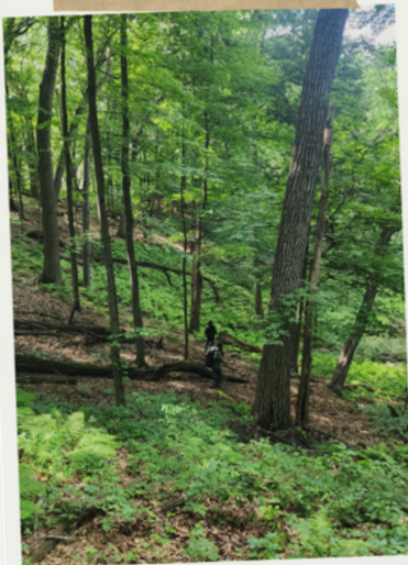
Exploring Theodore Wirth Regional Park's habitats